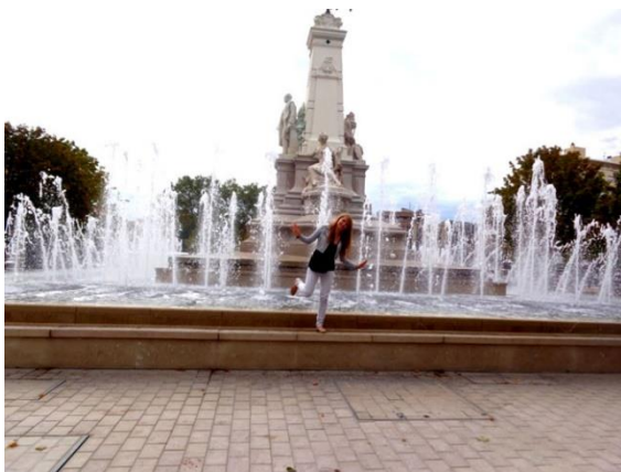
Dijon - Place de la République

“I am currently in my second year of a Master’s in French literature. I have just come back from Montpellier where I was studying. Now I am preparing my Master’s dissertation in Poland. My stay in Dijon helped my studies in Montpellier without a doubt. I always look back on Dijon with a lot of nostalgia. I am very grateful for having had the chance to study at the University of Burgundy.”