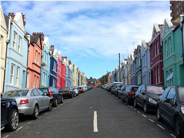
Coloured houses in Brighton. Brighton is unofficially considered the capital of the LGBT community in the UK.