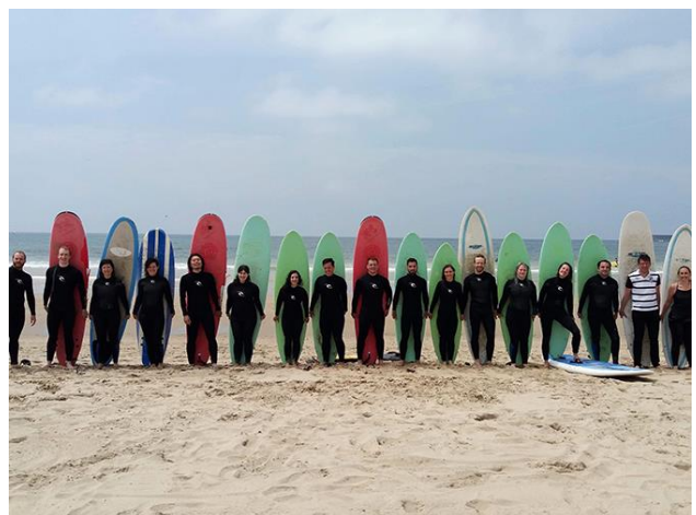
Trip to Portugal with colleagues.