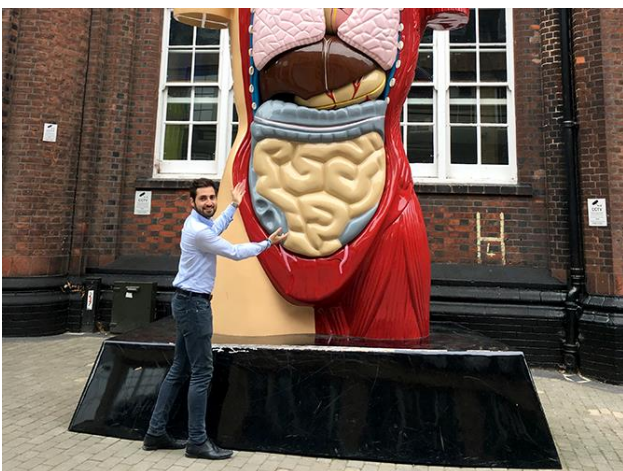
Norwich. Human intestine sculpture.