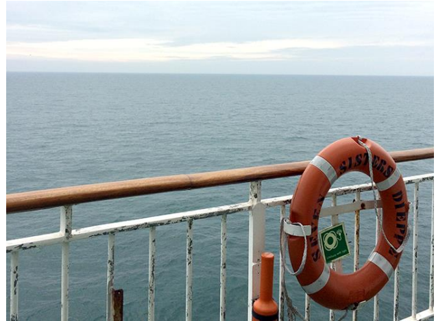
The 'Seven sisters' ferry which took me from France to the UK.