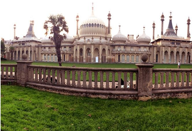
Brighton. The Royal Pavilion: former royal residence of George IV.