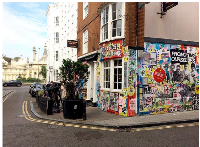
Brighton. The contrast between the Royal Pavillion and a street bar.