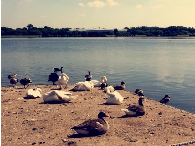
Willen Lake, Milton Keynes.