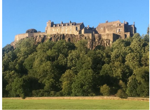
Stirling in Scotland.